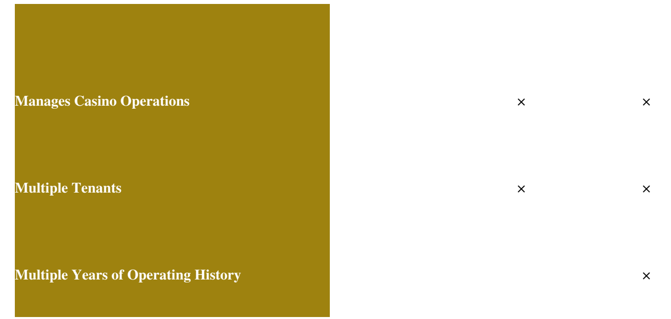
How Our Compensation Program is Aligned with Our Unique Business Model

We are focused on attracting and retaining executives with the knowledge and experience to grow shareholder value in our unique structure and operating environment and to lead the Company in an increasingly competitive business. With this as our goal, the Committee carefully designed the Company s compensation program with the assistance of our compensation consultant, FTI Consulting, Inc., to attract and retain the talent necessary to drive growth in a REIT structure through the acquisition of gaming assets.